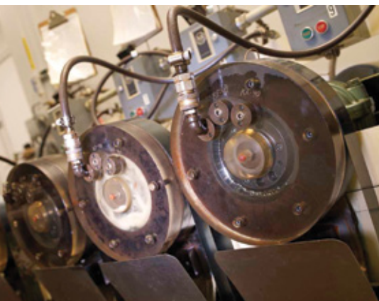
Rigorous testing confirms the superior performance of Reali-Slim bearings.

When it comes to thin section bearings, there's nothing like the real thing. Go with the original and global leader — specify Reali-Slim.